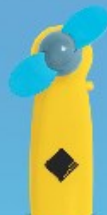
Bush Fly Fan

That's one of many educational tips you'll find in three new videos we've added to The Beanstalk. These short videos cover easy ways to help teach smart money management to your kids. To watch them, and to discover other insightful articles and activities, go to commbank.com.au/beanstalk