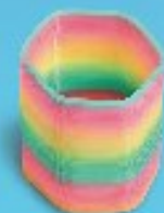
Wriggly Glow Worm